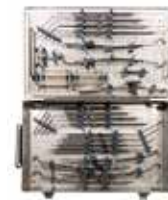
Sterilization Tray with Split Ring Applicator Set Components